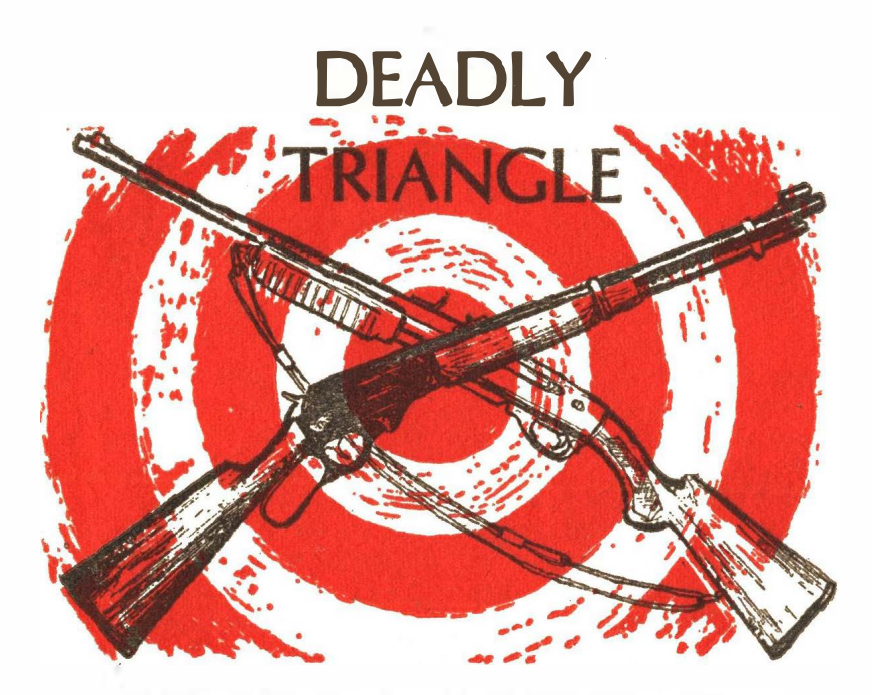
Mathematically a triangle is a useful form. Domestically it is abhorrent and can be eliminated by the squeezing of a trigger.